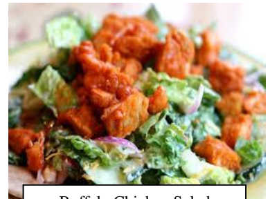
Buffalo Chicken Salad

Choice of Dressing: Balsamic Vinaigrette, Bleu Cheese, Caesar, Chipotle Cajun Ranch, Honey Mustard, Italian, Ranch, Thousand Island, Crumbly Bleu and Italian.